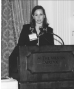
FCC panel: Helgi Walker.

to “conform domestic regulations with uniform global standards.” The recommendation focuses on “agency efforts to harmonize domestic and foreign regulations through international negotiations” and encourages agencies to “take into consideration public input” when undertaking such efforts.