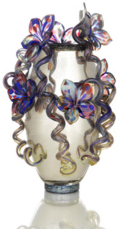
Dale Chihuly Silvered Venetian with Cobalt and Violet Flowers