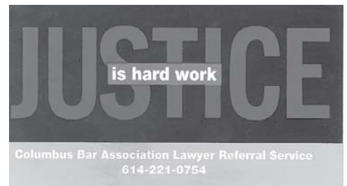
LRIS marketing efforts range from the high budget world of television advertising to lower cost efforts—such as printed magnets—to increase visibility.