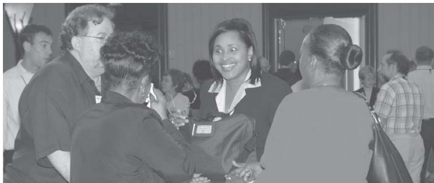
Networking sessions offered the chance to talk with colleagues from across the country, and rank among the most popular conference events.

The conference provided a forum for members of the private bar, law school leaders, corporate counsel, judges, and other stakeholders in the delivery of legal services to the poor could come to learn from each other and with the legal services and pro bono communities. The 2005 conference attracted 69 law school representatives, a huge increase from 2004.