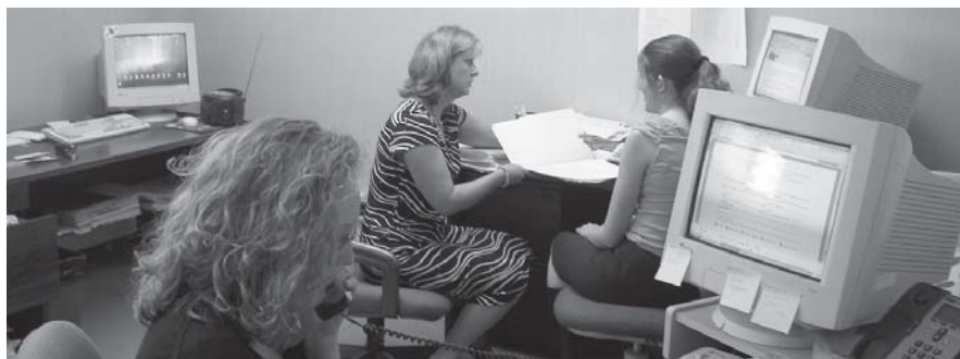
The clinics foster an ongoing commitment to equal justice among participating students, which can fuel their interest in performing pro bono work after graduating from law school and entering the practice of law.

With supervision, student interns are allowed to interview and counsel clients; draft and prepare pleadings, settlement agreements and legal memoranda; negotiate with lawyers who represent adverse parties; represent clients at depositions;