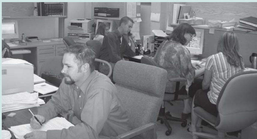
Students participating in the two clinics provide legal representation while building their skills.