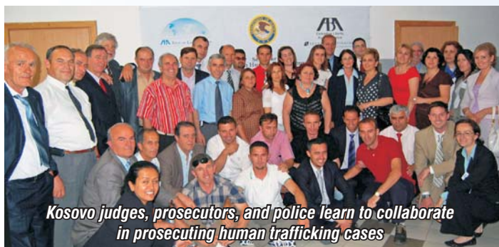
Kosovo judges, prosecutors, and police learn to collaborate in prosecuting human trafficking cases

50 local professionals attended this seminar that was led by Assistant United States Attorney and former Resident Legal