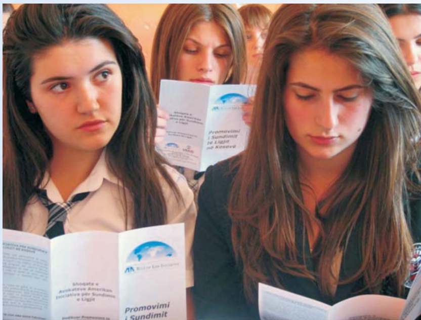
High school students participating in TeenLaw

TeenLaw is a course which introduces information about the Kosovo legal system to high school students and it was first introduced to Kosovo high schools by ABA ROLI. The course has reached 1500 high school students in Kosovo.