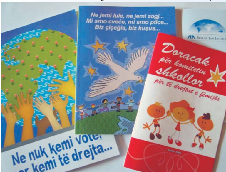
High school and middle school civics books published by the ABA and the Kosovo Education Center

ABA ROLI and the KEC also organized student visits with district, municipal, and juvenile court officers. During these