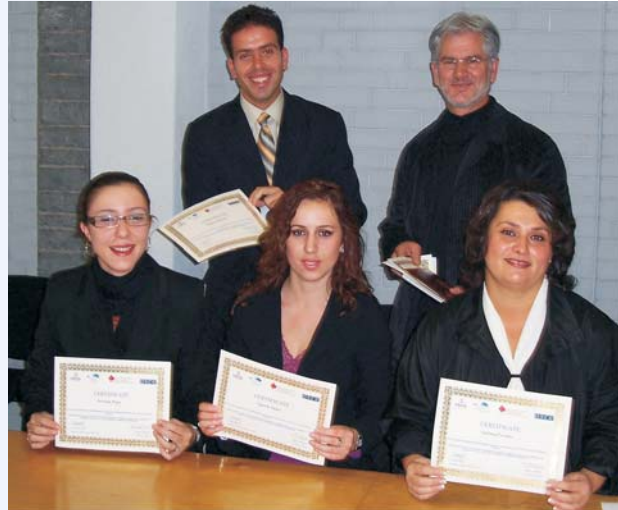
Kosovo law graduates who completed a one year apprenticeship program

Under Kosovo law, a law graduate is required to complete a one year apprenticeship in a lawyer's office or in a judge's chamber before he or she is eligible to sit for the Jurisprudence Exam which law graduates are required to pass before they can practice law.