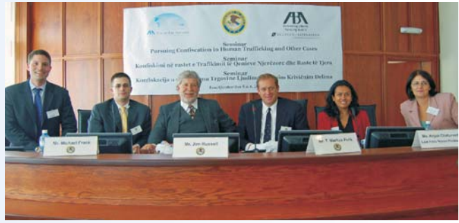
Working together on combating human trafficking in Kosovo