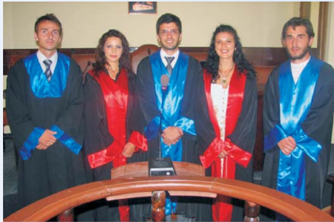
Kosovo law students compete in several mock trial competitions

The newly renovated Student Courtroom and offices have been constructed so that students can work with actual clients on real cases. The Student Courtroom was renovated by the US Department of Justice and USAID.