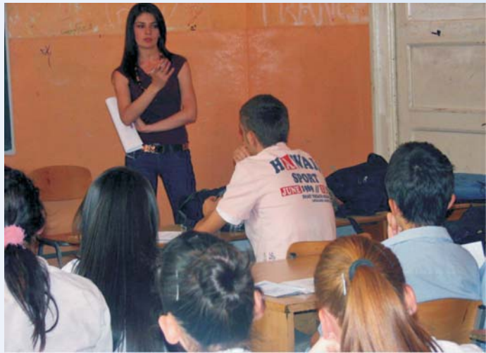
Law student facilitator discusses the courts to tenth graders in a Pristina high school

The project encouraged great debate among high school students and equips former law students with better communications and public relations skills. Law student engagement in TeenLaw demonstrates ABA ROLI's commitment to support the development of law students in Kosovo.