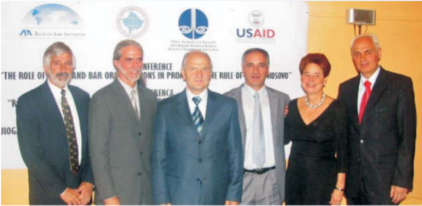
Kosovo President Fatmir Sejdiu led discussion on The Role of Bench and Bar Organizations in Promoting the Rule of Law

participated in the conference, discussing issues including the Ahtisaari Plan on Kosovo Status and its impact on the judiciary, the judicial selection process, the impact of local organizations and associations on the promotion of judicial independence and competence, and the need to increase gender and ethnic diversity on the bench.