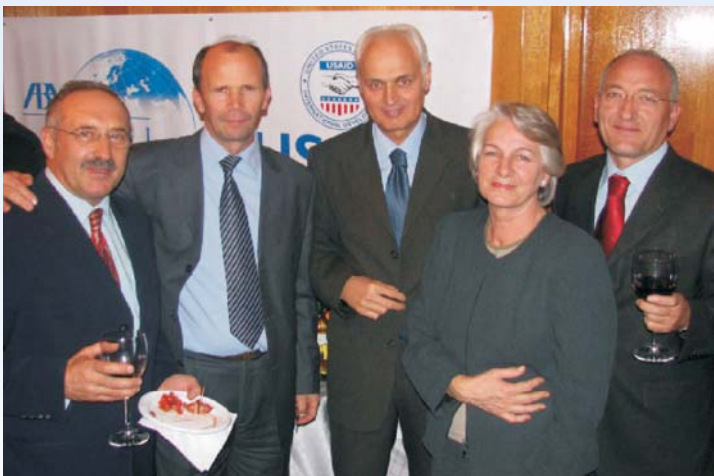
The support and collaboration of local professional organizations was a great contribution to the success of ABA's 10 years of work in Kosovo

Since commencing its program, ABA ROLI's primary focus has been the establishment of basic legal institutions in the post-conflict environment, the promotion of self-sustaining training for judges (especially related to judicial independence), attorneys and prosecutors, and a war crimes documentation project.