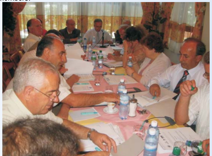
The KJA President addresses conference attendees on developing a transparent legal system

The KJA leadership with the support from ABA ROLI updated the organization's mission statement and 3-year strategic plan. The revised strategic plan focuses on the KJA's work on judicial independence, accountability, and integrity with that of other actors in the legal and justice sectors. Moreover, the KJA has successfully established relationships with other judges' associations in Central Europe in order to gather best practices on issues such as funding, member activities, outreach, publications, ethics, advocacy, lobbying, and judicial salaries.