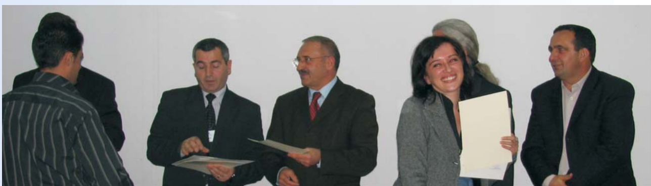
The apprenticeship program refreshes the legal and judicial professions with new qualified and well-trained future judges, lawyers, and prosecutors

Through its support of the apprenticeship program, the ABA ROLI aims to contribute to refreshing the legal and judicial professions with new, qualified and well-trained future judges, lawyers and prosecutors. The program has been highly successful, as we have learned from our interviews with the graduates of the program that many of them are engaged in promoting the rule of law in Kosovo.