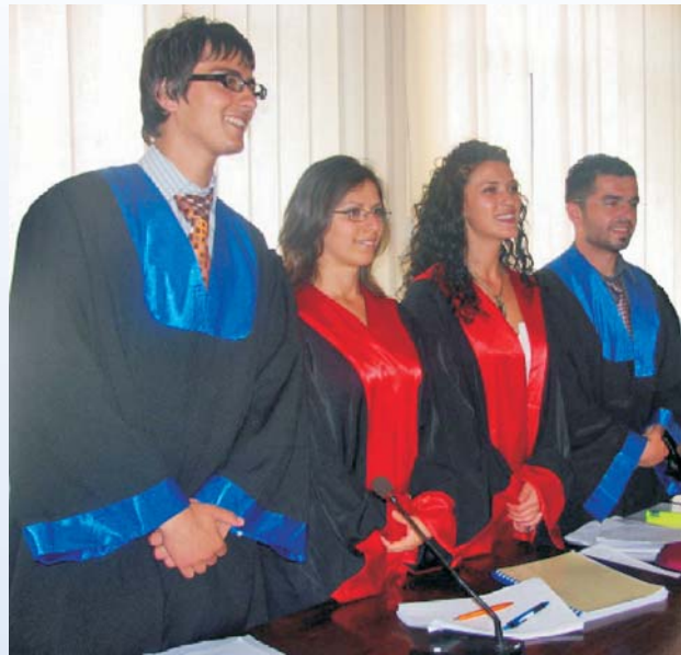
Legal education reform is a primary focus area for ABA ROLI Kosovo

The ABA established the public service project Rule of Law Initiative (ABA ROLI) in 2007 in the belief that rule of law promotion is the most effective long-term antidote to the most pressing problems facing the world today, including poverty, conflict, endemic corruption and disregard for human rights.