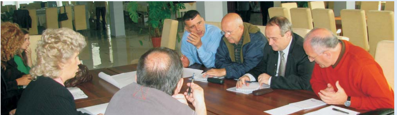
The KCA members working on their 5 year Strategic Plan

The KCA is solidifying its organizational development that will guide them through a period of intensive growth and targeted development.