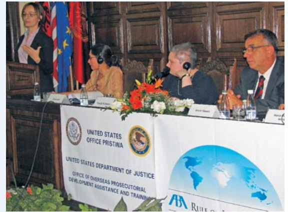
Memorandum of Understanding signed between the US Embassy in Prishtina, ABA ROLI, and the University of Prishtina to introduce new course

All new courses and clinics developed and introduced by the ABA ROLI in cooperation with the Law Faculty and the Rectorate of the University of Prishtina are fully and officially incorporated into the curriculum as either elective or required course, and they have all been assigned credits under the European Credit Transfer System (ECTS) and the Bologna