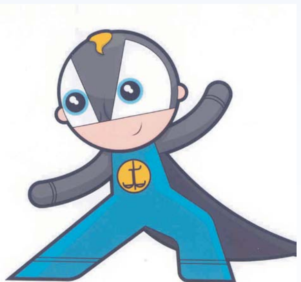
Justice Kid increases understanding of the law among the country's youth