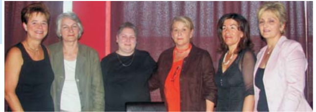
Working together to develop a strategy to increase the participation of women in the Kosovo legal system

ABA ROLI directly supports the Gender and Minority Committee of the Kosovo Chamber of Advocates (KCA) through different projects. The ABA's goal is to assist Kosovo women and minorities in attaining equality in the legal profession.