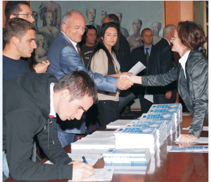
ABA ROLI's Publication Launch of the Legal Education Reform Index

In Kosovo, ABA ROLI has conducted the Judicial Reform Index in 2001, 2004 and 2007, the Legal Professional Reform Index in 2004 and again in 2007, and the Legal Education Reform Index in 2008. The JRI provides an assessment of the state of the judiciary in Kosovo, the LPRI intends to help legal professionals to act on behalf of their professional interests while the LERI findings demonstrate where the Kosovo legal education system stands.