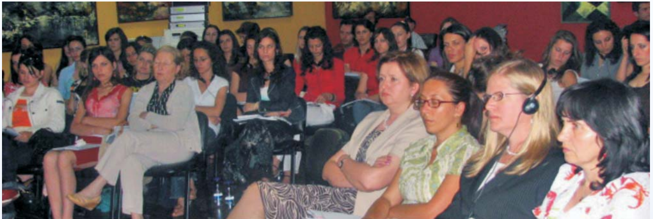
The goal of ABA ROLI is to assist Kosovo women and minorities in attaining equality in the legal profession